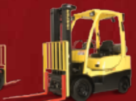
S50CT Cushion tire