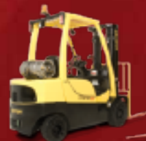
H50CT Pneumatic tire